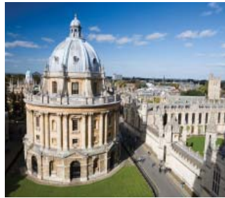
Oxford University, England