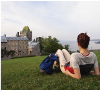
Quebec City, Canada