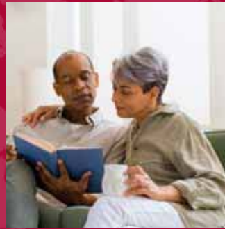
WAITING FOR MEDICARE COVERAGE