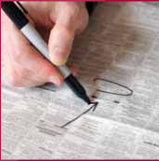
TRANSITIONING BETWEEN JOBS